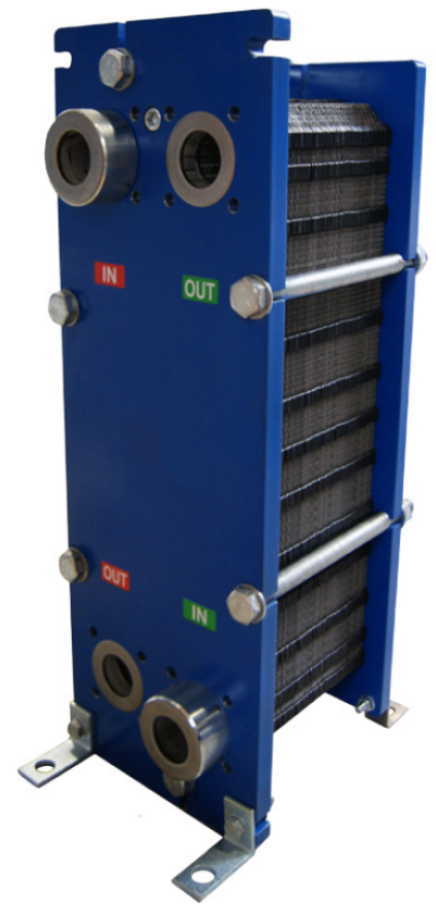
Model: D16 shown