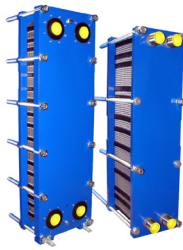
PLATE & FRAME HEAT EXCHANGERS