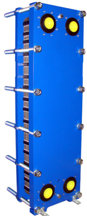
Model: D31A shown