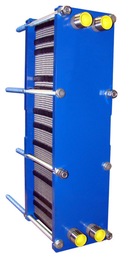
Model: D8A shown

The corrugated "herringbone" pattern ensures turbulent flow in the whole effective area. Furthermore, this pattern brings "metallic" contact between the plates, and together with locking devices on the gaskets, the plate pack is easily assembled. The plate pack is held firm and safely between the fixed head and movable follower of the frame.