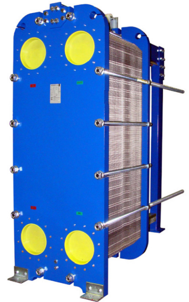
Model: D113 shown