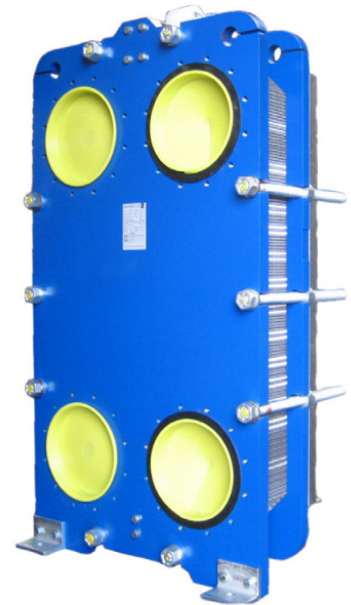
Model: D81 shown